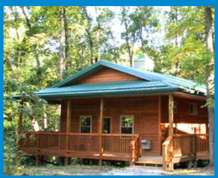
YMCA Camp Carson is a beautiful space for a weekend away, group retreat, reunion, company meeting, or teambuilding event. We offer small and large spaces, indoor and outdoor - practical spaces with a warm Camp atmosphere.