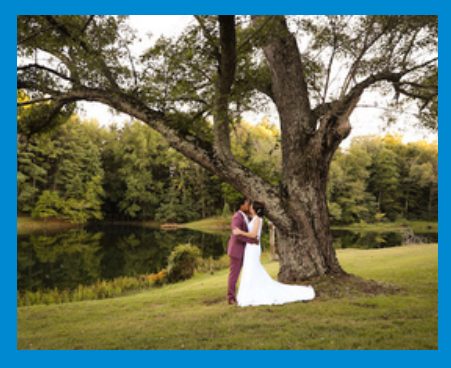
YMCA Camp Carson has beautiful options for indoor or outdoor weddings, including a lakefront amphitheatre, chapel, gazebo, and suspension bridges. We also offer a service kitchen in the lodge, changing rooms, restrooms, and parking.