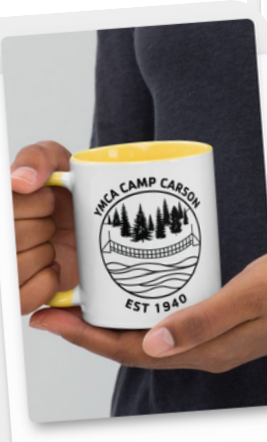
ACCESSORIES, DRINKWARE Mug with Color Incide