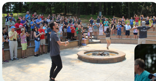
Staff led Reunion guests in a favorite camp song to kick off the Dedication Ceremony.