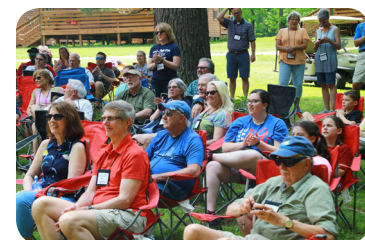
Right: Reunion guests at the presentation