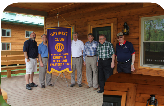
Left: Donors for one of the original cabins built in 1941, The Optimists of Downtown Evansville continued their tradition of support for camp through their sponsorship of the new Aztec cabin.