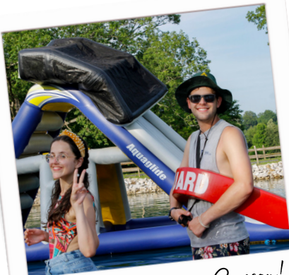
Summer at Camp Carson!