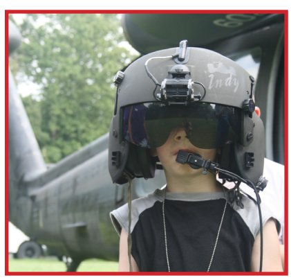
Young Black Hawk Pilot

We as a Camp Carson staff were touched by these special troopers as they shared their hearts with us and each other during journal and discussion sessions set aside for this purpose. Early in the week the campers made cabin banners