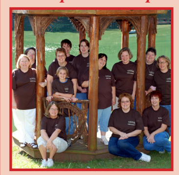
Fall Retreat a Success! Watch for Spring Scrapbook Retreat April 2009. Visit our website to see more photos, info and comments.