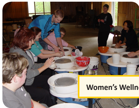
Women's Wellness Weekend